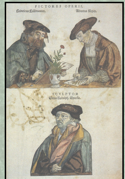
LEONHART FUCHS (1501-1566). De historia stirpium commentarii insignes. Basel: In officina Isingriniana, 1542. "regarded as being among the most accomplished herbal of the Renaissance period"